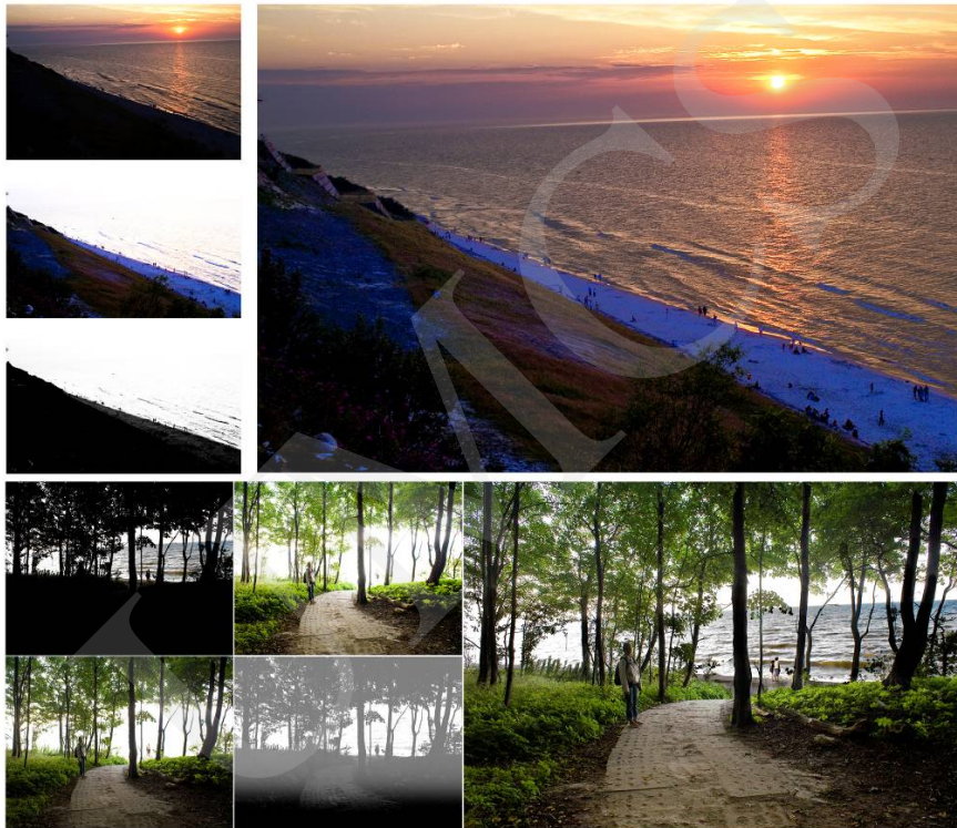
Fig. 4. Multiexposed Image Fusion example sets. Small images are part of the original multiexposed image set; the last small, blurred image is the Height Map; the large, color image is the fused image

images on the basis of the mask values. The reconstructed images are shown in Fig 4. and the numerical differences between these two methods are shown in Table 1.