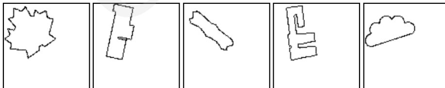
Fig. 4. Some exemplary test objects in the experiment exploring the influence of scaling

The last experiment explored the influence of scaling on the recognition results. This time, two separate values of deformation were utilized. At first the test objects were twice diminished, then twice enlarged. That gave 100 instances of test objects. A few of them are presented in Fig. 4. This time the recognition rate was equal to 91%. As it turned out, the reduction in size was much more difficult to handle (8 incorrect matches) than enlargement (only 1). It can be explained by small sizes of the resulting objects. Part of an image with the test trademark was only 50 by 50 pixels in size. Therefore, the results can be nevertheless assumed as satisfactory.