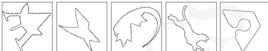
Fig. 3. Some exemplary rotated test objects in the second experiment

In the second experiment 50 trademarks rotated by a random angle were tested. Additionally, noise influenced a silhouette. This time, two objects were not recognized properly. A few examples of tested objects are provided in Figure 3.