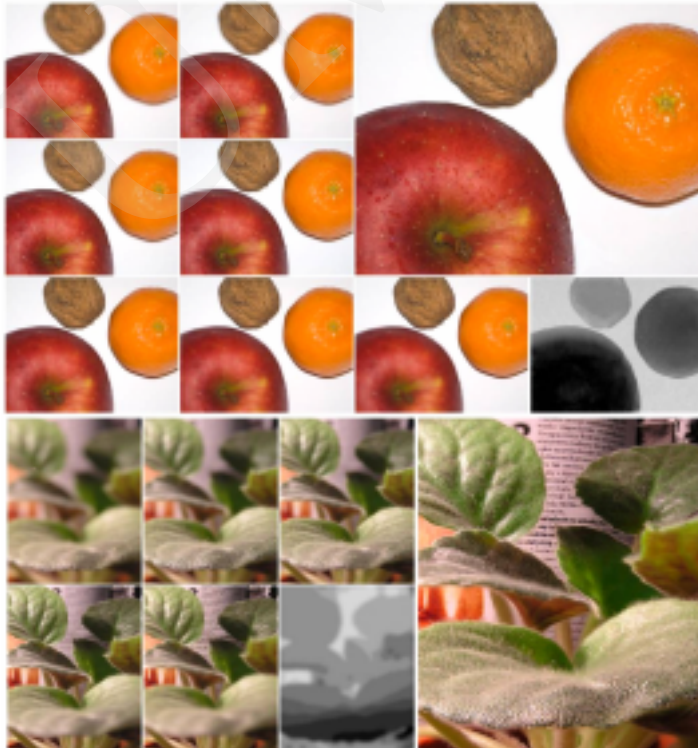
Fig. 3. Multifocus Image Fusion example sets. Small images are part of the original multifocus image set; last small, blurred image is the Height Map; large image is the fused image