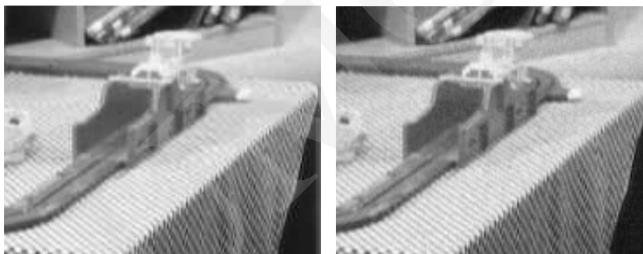
Fig. 3. Enlarged fragment of the test image compressed using the DCT-based (JPEG/JFIF) and 2DKLT-based algorithms

Figure 3 shows a comparison of the two compression methods: DCT-based (on the left) and 2DKLT-based (on the right). Enlarged fragment of the test image shows that the 2DKLT-based compression gives much more details reducing blurring of individual blocks. It is a result of optimal adaptation of basis functions for this specific image.