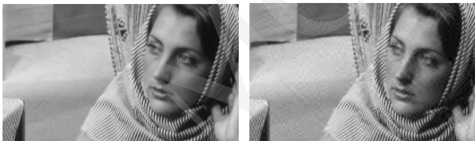
Fig. 5. Fragment of the original test image and its stegoed variant

KLT spectrum of its pixels. Hence, the message is being expanded into a longer sequence of small values e.g. binary ones. Then we have to generate a key which will determine where in the transformed blocks the elements of expanded message have to be placed. The key is a sequence of offsets from the origin of each block. It is important to place the message into the “middle-frequency” part of each block as a compromise between output image quality and robustness to intentional manipulations. This rule is especially significant in the case of images containing a large number of small details, which helps keep all the changes imperceptible. The only noticeable difference can be observed in the areas of uniform color. As an example of the embedding, the following image is presented (see Fig. 5).