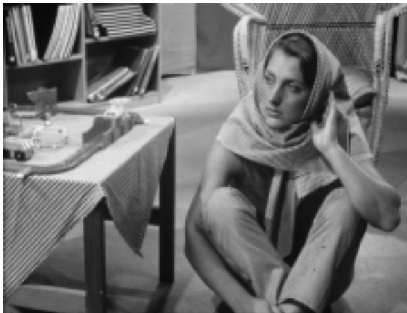
Fig. 1. Test image (“Barbara”) used in experiments

In the further parts of the paper we show the main principles of 2DKLT together with the three application areas: image compression, image scrambling and information embedding. All the experiments have been performed on the standard benchmark images. The image “Barbara” (8-bit gray-scale, 640×480 pixels) shown in Fig. 1 is employed in all cases as an example, since it contains areas of different nature (i.e. smooth, detailed, edges, etc.) and a human face, on which any unusual artifacts can be perfectly observed.