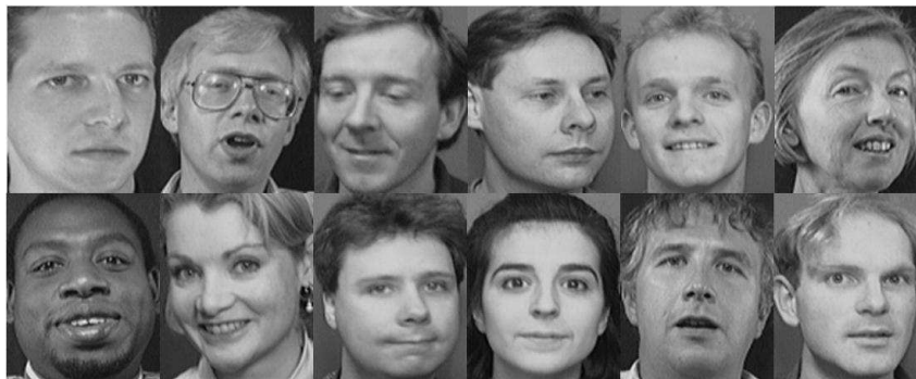
Fig. 1. Example images from AT&T database used in experiments