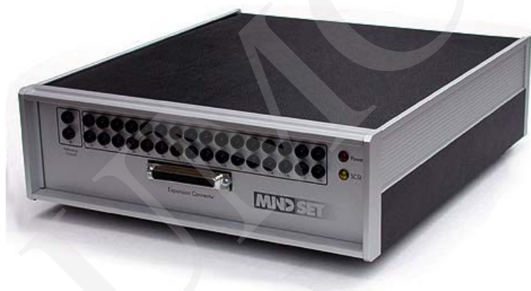
Fig. 1. Mindset MS-1000 EEG System.

MindSet MS 1000, manufactured by Nolan Computer Systems, is used as the hardware source of an EEG signal (Fig. 1). It is a real-time device containing a 16-channel analogue differential amplifier which receives signals from cap electrodes and amplifies them 32000 times. An amplified analogue signal is converted into a digital one as it goes through sample-and-hold circuits and an analogue-to-digital converter. Inside the device, there is a 32kB RAM buffer enabling it to withstand arrhythmical cooperation with a PC [9].