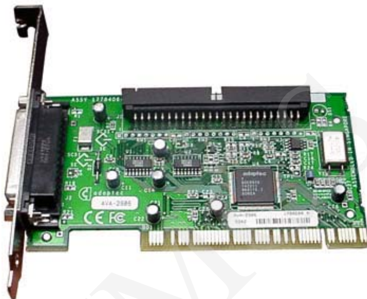
Fig. 2. Adaptec AVA 2906 controller.

For practical reasons (good quality development tools and documentation without restrictive license limits), our work is carried out in the GNU/Linux operation system environment with the application of a gcc compiler.