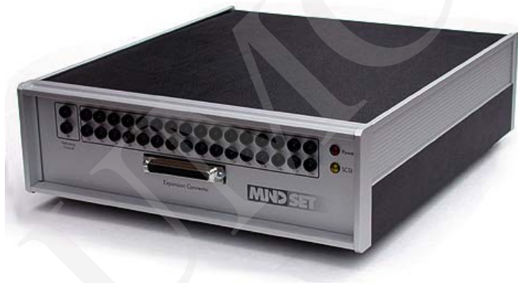
Fig. 1. Mindset MS-1000 EEG System.

MindSet MS 1000, manufactured by Nolan Computer Systems, is used as the hardware source of an EEG signal (Fig. 1). It is a real-time device containing a 16-channel analogue differential amplifier which receives signals from cap electrodes and amplifies them 32000 times. An amplified analogue signal is converted into a digital one as it goes through sample-and-hold circuits and an analogue-to-digital converter. Inside the device, there is a 32kB RAM buffer enabling it to withstand arrhythmical cooperation with a PC [9].