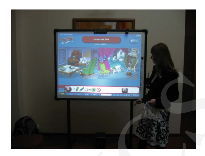
Fig. 3. Working with an interactive whiteboard with educational software (source: www.pomoceszkolne.pl).