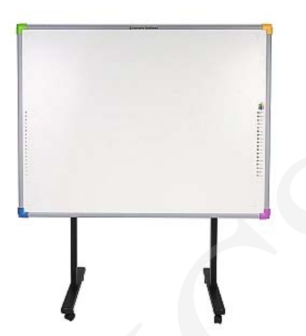
Fig. 1. An interactive whiteboard - Interwrite DualBoard.