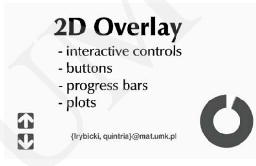
Fig. 4. Presentation of the 2D Overlay: two buttons, a static label and a circular progress gauge to-gether with a slide exhibit.

up.onClick = &display.camera.forward; down.onClick = &display.camera.back;