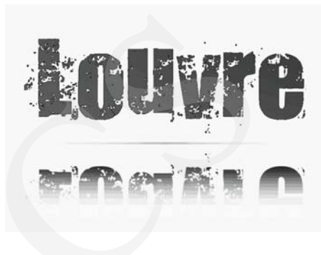
Fig. 1. The project logo as an exhibit.

The rest of the paper is organized to describe the LOUVRE project from different points of view: the following section contains technical information about the programming library, including hardware and software requirements. Section 3 describes how LOUVRE-based applications can be interacted with – the end user point of view. Section 4 contains basic information on how to use LOUVRE for scientific visualization and how to add new types of objects. Section 5 discusses the relation of LOUVRE to other similar tools. The paper is concluded by a discussion of the strengths and weaknesses of this form of visualization, as well as possible applications and future development.