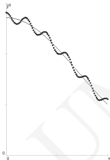
Fig. 2. The exact solution and \tilde{y}_i^0 for l = 2 , T = 1 , \beta_0 = 0.5 , E_S = 10^{-1} , h_i^0 = 0.02 .