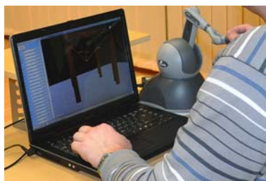
Fig. 5. The photo of the computer screen with the application dedicated to control the manipulator platform.

In the other screen window or on the second computer screen the camera image is displayed. The use of the second screen is not a problem since in practice, today each notebook is equipped with video output for an external computer monitor and a computer operating system is ready to use it.