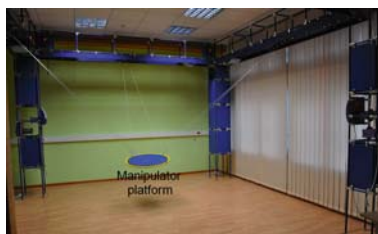
Fig. 3. The photo of described cable-driven platform.