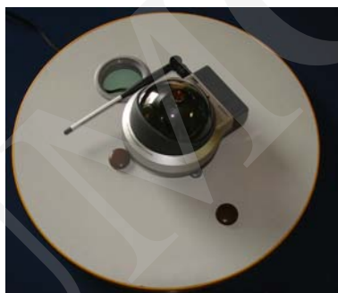
Fig. 4. The photo of the assembling board with the IP camera.

The cable driven platform has the form of the circumscribed circle about the equilateral triangle. The platform is adapted for installation of different work equipment.