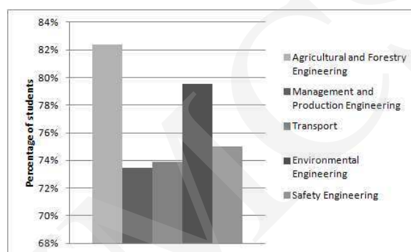
FIGURE 4. Percentage of students who believe that the use of a computer during the laboratory classes will increase their attractiveness.