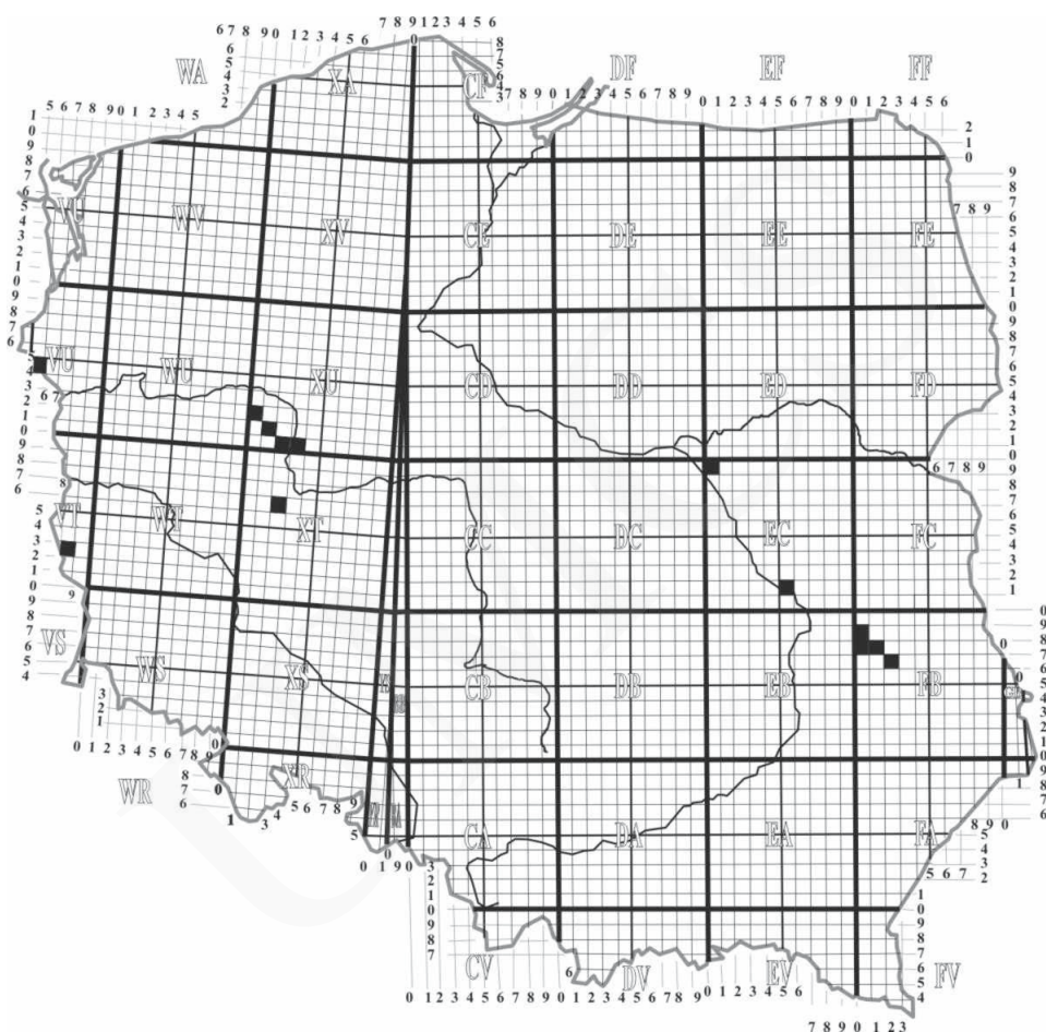
Fig. 6. Distribution of Ostearius melanopygius in Poland.

which enables O. melanopygius to disperse and create new populations almost everywhere (potted plants, pots, packaging, etc.). Apart from anthropogenic dispersion, an additional factor facilitating the expansion of O. melanopygius are its large aeronautical capabilities (30, 96). Early spring finding of gravid female in the litter in Lublin may also suggest accommodation of O. melanopygius to wintering in natural biotopes.