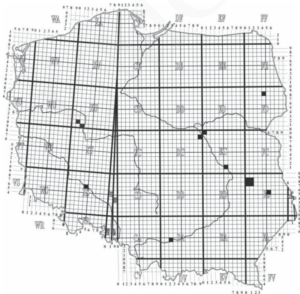
Fig. 4. Distribution of Uloborus plumipes in Poland.

First time recorded from Poland in 2001 from Białystok (101). Since 2002, this species was collected and observed in a number of localities in Lublin, and in several other Polish cities (87). Bigger populations which occur in large garden centers in Lublin may be described as semiautochthonic. They are formed by individuals reproducing partially in place, but these populations are still supplied with a number of specimens coming from almost every transportation of ornamental