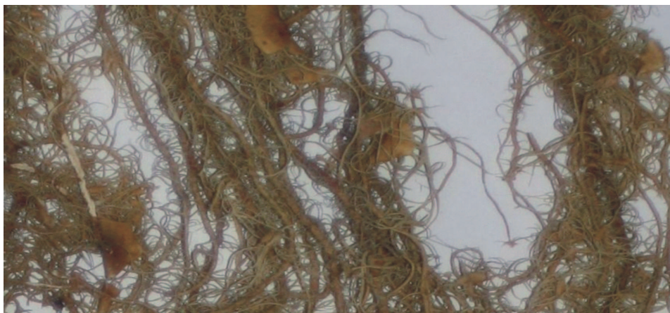
Fig. 2. Usnea balcanica Bystr., thallus fragment (slightly magnified).