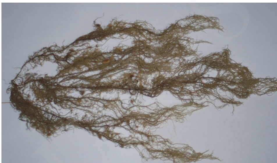
Fig. 1. Usnea balcanica Bystr. (3x smaller).

Currently, the authors have identified this specimen as Usnea balcanica . This is a new species in the lichen biota in Poland.