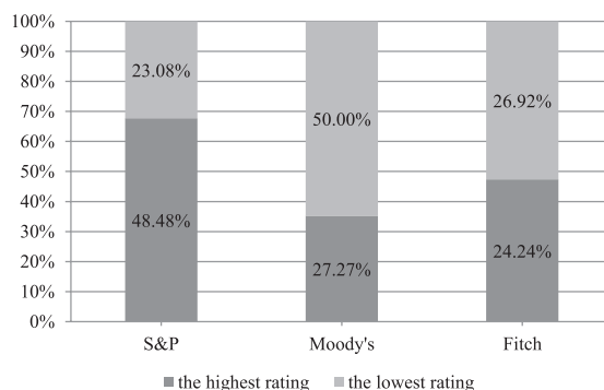
Figure 3. The highest and the lowest rating awarded by agencies

Furthermore, the analysis of the ratings awarded to the issuers by individual agencies was carried out, in order to check which agency gave the highest and the lowest credit ratings. For this purpose, the issuers which received the ratings from two or three agencies were analyzed. The issuers which received the rating only from one agency were excluded from this sample. The analysis does not also include the situations where the assessment of the agencies was the same.