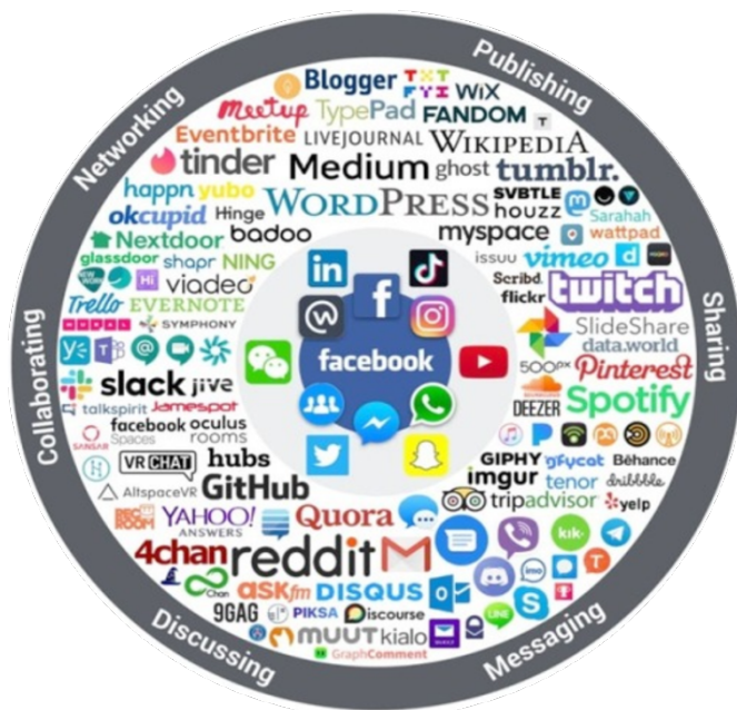
Figure 1. The social media landscape in 2020

Social media offers many opportunities to engage in dialogue with customers, as shown in Figure 1. Every year there are more and more such methods, however, it should be remembered that some of the presented ones are not yet available in different countries. Interestingly, Facebook and Twitter are the leaders in social media. A large number of Facebook users use it on average more than 30 minutes a day, and there are also other platforms such as Twitter, Instagram, Kik or Snapchat.