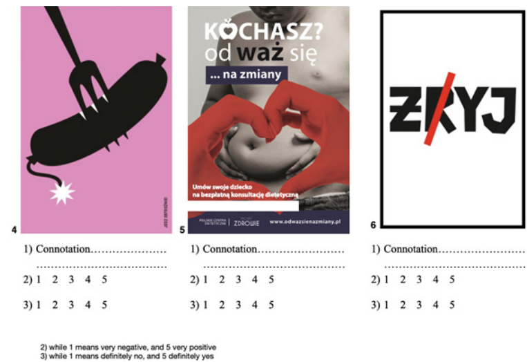
Figure 2. Focus group interview, connotation test form for the participants (p. 2)

Note: Translation of text from poster No. 5: “If you love, dare to change”. Make an appointment for a free dietary consultation for your child. 1 Translation of text from poster No. 6: “Live / Devour”. 2