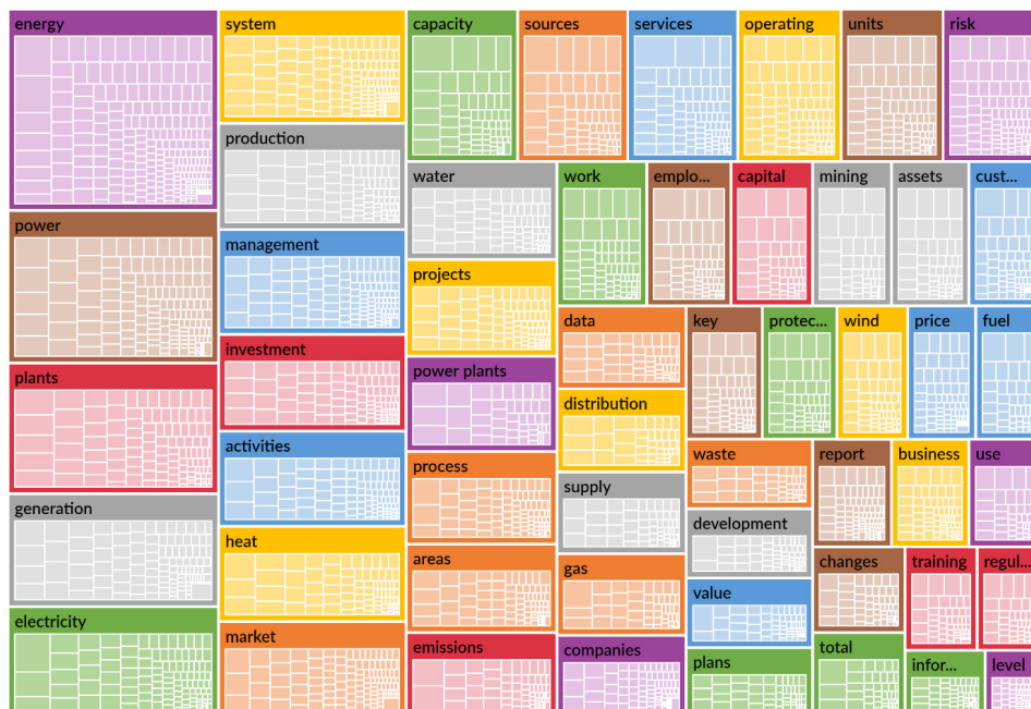
Figure 1. Hierarchy Chart – compared according to the amount of coding references (reports: ENA, PGE, TPE, ZEP)