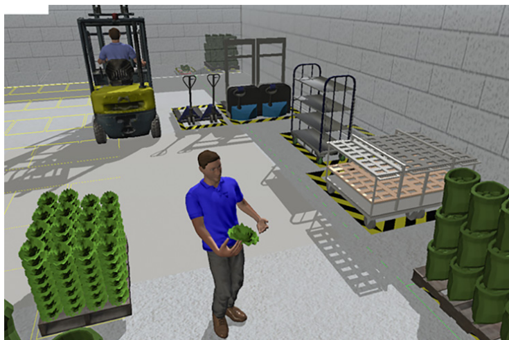
Figure 2. View of the analyzed site of the 3D digital twin

For the implementation of digital modelling, the authors used the model of the so-called digital twin in the fourth step of the method (K4), which in a fragment is shown in Figure 2.