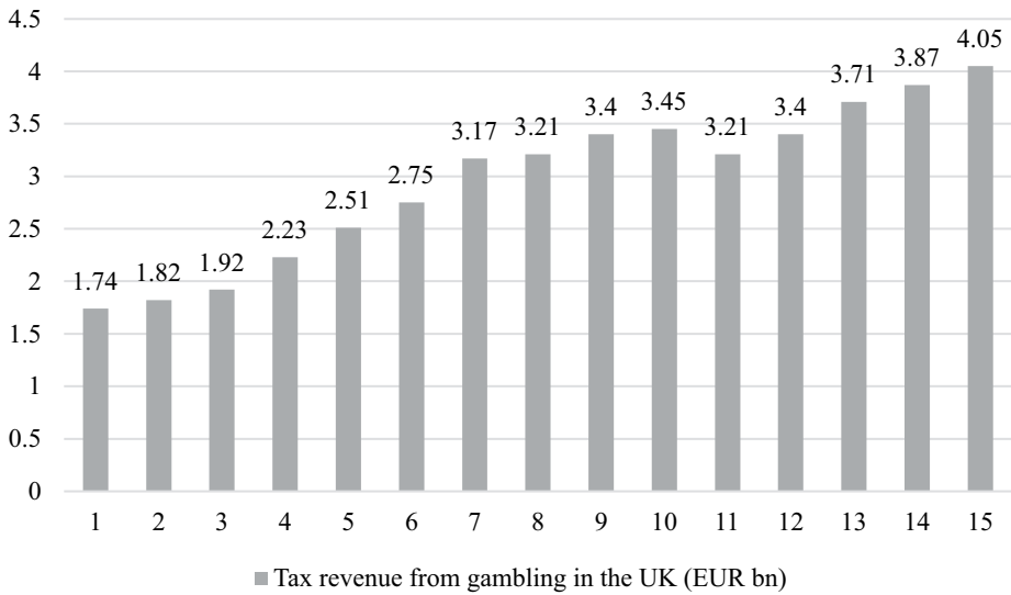
Figure 4. UK's tax revenue from gambling 2010–2024