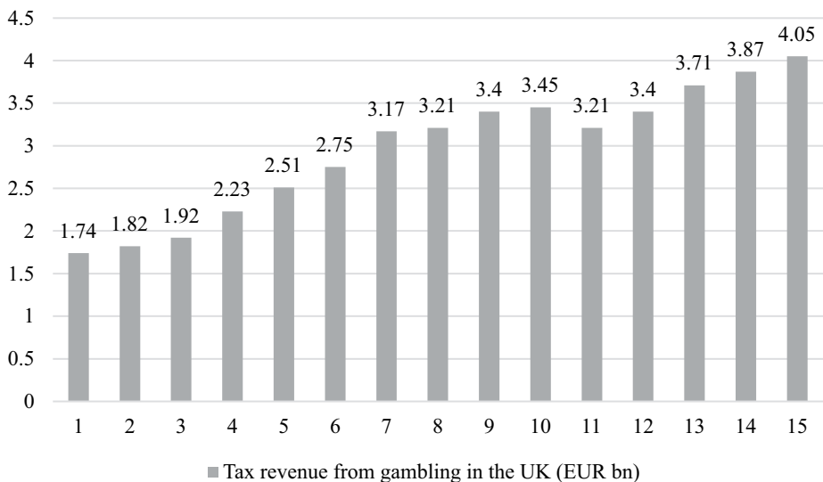
Figure 4. UK's tax revenue from gambling 2010–2024