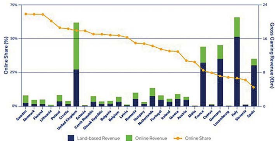
Figure 1. GGR levels of EU member states and the UK in 2023

Gambling markets can vary depending on the degree of regulation in a country, economic conditions and social attitudes. One measure of the size of the gambling market is Gross Gaming Revenue (GGR). In other words, it is the sum of stakes paid less winnings paid out. In many European countries GGR is used as the basis for taxing gambling activities.