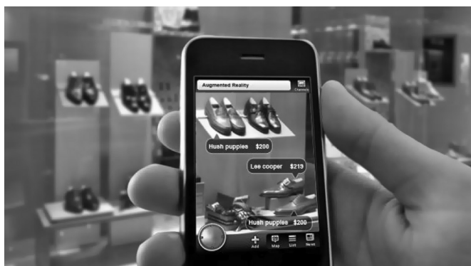
Figure 1. Augmented reality in the point of sale – a shoe shop

land, AR utilization for marketing purposes is still rare, but in the world it develops faster and faster. AR can also add variety to any kind of events, fairs, or business meetings, as well as occasional parties 3 . Figure 1 presents the possibility to use AR in the point of sale – a shoe shop.