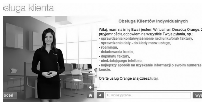
Figure 4. Virtual Orange Advisor – Ewa

An example of chatbot application in marketing communication is the Orange company. It has put in motion the Virtual Advisor Ewa on its own www page (Figure 4). Besides the extensive base of issues connected with customer service, this chatbot is able to answer a number of other questions 7 .