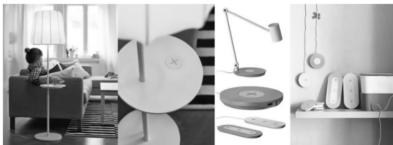
Figure 5. Internet of Things – IKEA