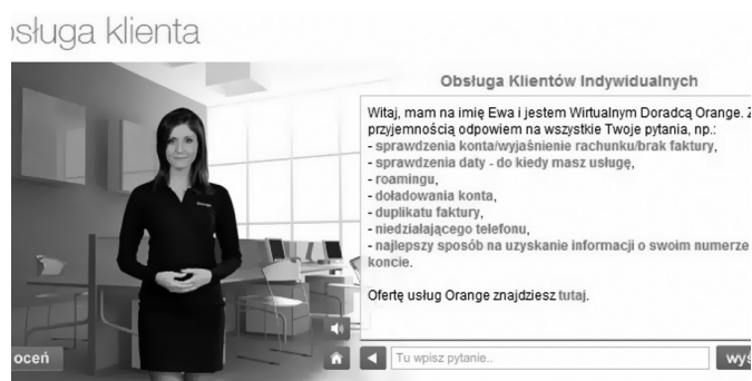
Figure 4. Virtual Orange Advisor – Ewa

An example of chatbot application in marketing communication is the Orange company. It has put in motion the Virtual Advisor Ewa on its own www page (Figure 4). Besides the extensive base of issues connected with customer service, this chatbot is able to answer a number of other questions 7 .