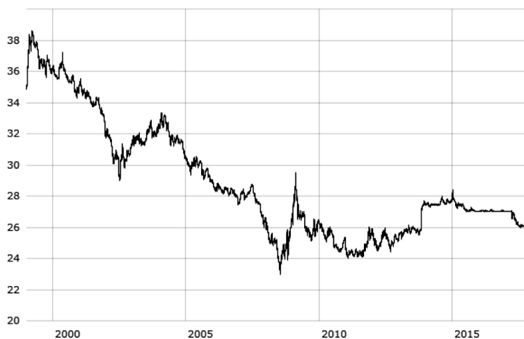
Figure 3. Fluctuations in the crown's rate in relationship to the euro, 2000–2017