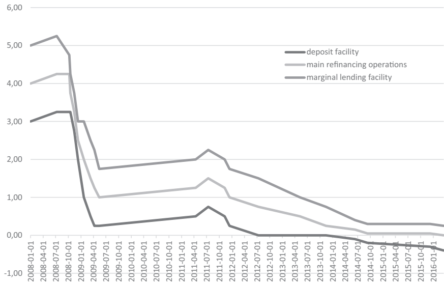
Figure 1. Changes in the European Central Bank interest rates between 1 January 2008 and 31 December 2018

The European Central Bank introduced its anti-crisis monetary policy relatively late. The US Federal Reserve System began a series of interest rate cuts as early as September 2007, but the ECB decided to do so more than a year later. In mid-2012, the deposit rate was 0%, and since June 2014, it has been negative. Since September 2014, the base reference rate has been close to zero. Figure 1 presents the data on the changes in the base interest rates of the ECB.