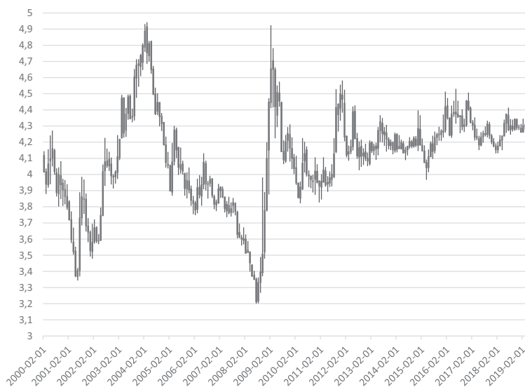
Figure 2. EUR/PLN spot rate, 1-month candlestick (February 2000 – March 2019)