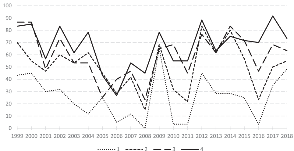
Figure 1. The average percentage of cases in which the returns were normally distributed, taking into account all tests performed and all indexes, presented for each year and for each returns' interval