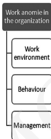
Fig. 4. The Model of the Three Forces of Employee Anomie

Source: own study based on: D. Ambroziak, M. Maj, Oszustwa i nieuczciwość w organizacjach. Problem anomii pracowniczej – diagnoza, kontrola i przeciwdziałanie , Warszawa 2013, p. 93.