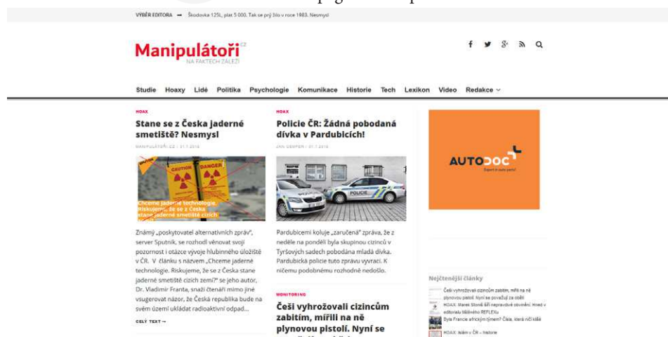
Photo 2. Home page of manipulatori.cz