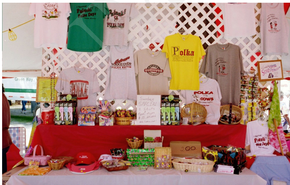
Figure 6. Souvenir Tent at Pulaski Polka Days, 2004.

This resilience is also seen in the polka community’s ability to sustain an independent polka economy, a community-based business alternative to the mainstream of corporate music production (Gunkel 2004, 414). [See Figure 6] In addition to the festivals and conventions, this economy includes polka recording studios, production and distribution, record and CD labels, polka record stores, polka Radio shows polka cruises and travel, polka internet sites, polka associations such as the IPA (International Polka Association) and UPA (United Polka Association), and polka publications. [See Figure7]