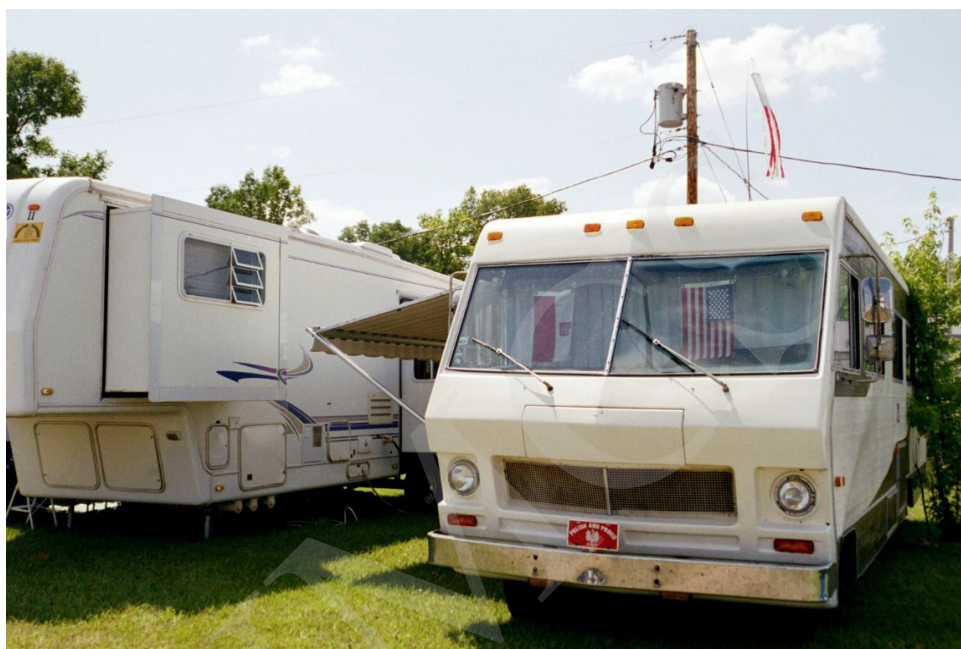
Figure 11. Mobile Home in the Ethnic “Neighborhood” displaying Polish American symbols.

In his critical work on cultural dimensions of globalization, Arjun Appadurai (1996) distinguishes between culture and the cultural. While culture is associated with a static conception of a people associated with specific traits, the cultural refers to situated differences, contrasts, and comparisons “that either express, or set the groundwork for, the mobilization of group identities” (13). Appadurai’s distinction expresses the fluidity of identity associated with diasporic movements. Describing complex repertoires of images, narratives, and ethnoscapes, he notes that ethnic images are diasporic. Appadurai recognizes the synergistic and serendipitous nature of the flow of representations. I would argue that this is the nature of the symbolic landscape from which Polish American polka people draw to fashion their group identity. In this landscape, symbols of farm prosperity, twentieth century nationalisms, hybrid music, Polish folk culture, and American ethnic urbanism all emerge as a field from which polka people craft their sense of identity and belonging. This sense of Polish American identity is formed in the space of a mobile community of polka music fans who recreate a movable Polish American “neighborhood” on the festival circuit.