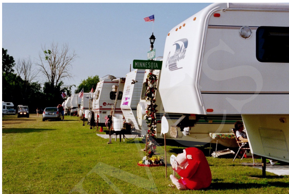
Figure 2. A motor home “village” at Pulaski Polka Days, 2004.