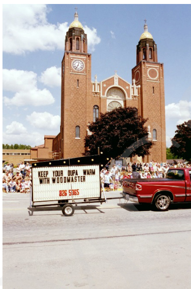
Figure 10. Polish American linguistic capital on display in the Pulaski Polka Parade, 2004.