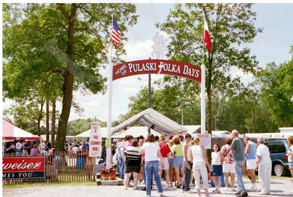
Figure 1. Entering the “neighborhood” at Pulaski Polka Days, 2004.

Recent scholarship on Polish American polka has argued that contrary to popular stereotype, polka is innovative hybrid alternative music and, furthermore, that preserving polka's history is an important, but often overlooked, part of preserving American multicultural history (Gunkel 2006, 5 – 8). This project continues that research by providing this spatially-framed study of the phenomenon of the seasonal polka festival. Over a period of five years, I visited polka festivals in North America as a participant observer, documenting the social and cultural landscape of these gatherings of polka people. This essay traces the nature of imagined community in Polish American polka festivals—understood as a diasporic ethnoscape--exploring the construction of ethnic space in the twenty-first century.