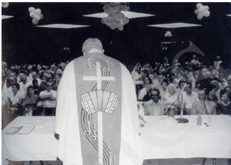
Figure 3. Priestly vestments at the International Polka Association's Polka Mass, 1983.