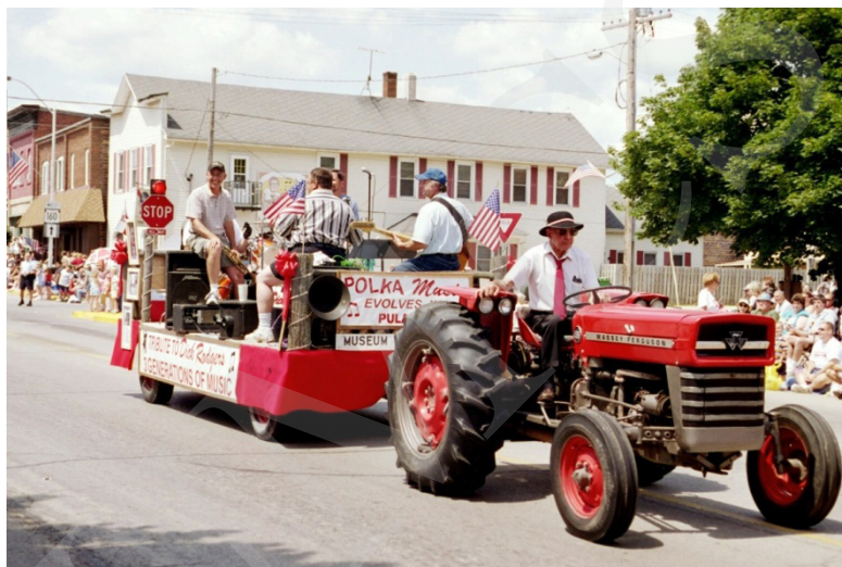
Figure 9. A postmodern pastiche of ethnic symbolism in Pulaski’s Polka Parade, 2004.

The Pulaski polka parade is a virtual feast of hybrid ethnic symbolism. [See Figure 9] In a stunning moment of visual pastiche, an antiquated American tractor was driven by a farmer in a Górale [Polish mountaineer] hat, pulling a wagon that carried polka musicians. The wagon was decorated by American flags and a hand-written sign claiming “polka music evolves in Pulaski.”