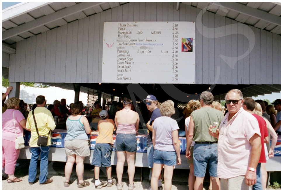
Figure 8. Food Concessions at Pulaski Polka Days, 2004.

Duck's Blood Soup], a dish virtually unknown in contemporary Poland (even absent from Polish dictionaries) but a classic for late nineteenth century émigrés from the Prussian partition of Poland. Five generations later, Polishness means Czarnina .