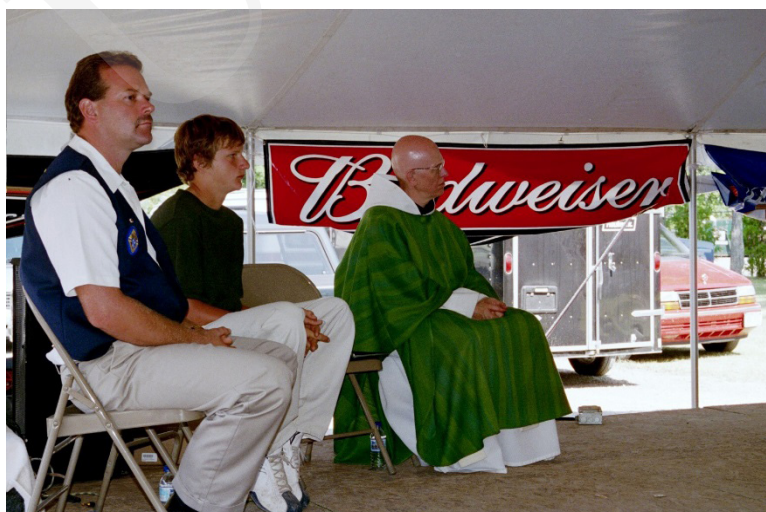
Figure 5. The Priest and Acolytes at Polka Mass, Pulaski Polka Days, 2004.

This shamelessness about Catholic Polish identity is a signal of great confidence in ethnic identity formation, if we recall that for more than a century “immigrant Catholicism or “ghetto Catholicism” was seen as “an obscurantist form of cult worship