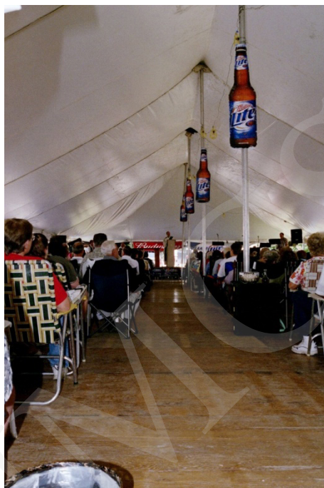
Figure 4. The Sacred and Profane merge at the Polka Mass, Pulaski Polka Days, 2004.