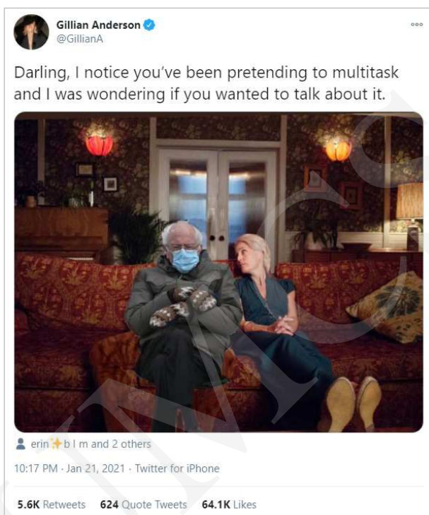
Fig. 6: Celebrities such as actress Gillian Anderson contributed to election memes spreading, sharing variations of “Bernie’s Mittens”

depicted as “cool” and culturally informed both in memes and ... fan writings” (2020) which are widely created and shared. This relatable image soon lost all political significance, becoming seemingly a floating signifier without clear meaning or reference. The iconic photograph of Bernie in his mittens was inserted into anything – from pop cultural imagery such as the Totoro meme 6 to the NASA rover landing – and reproduced in many media, be it deep faked video clips or as a crocheted doll.