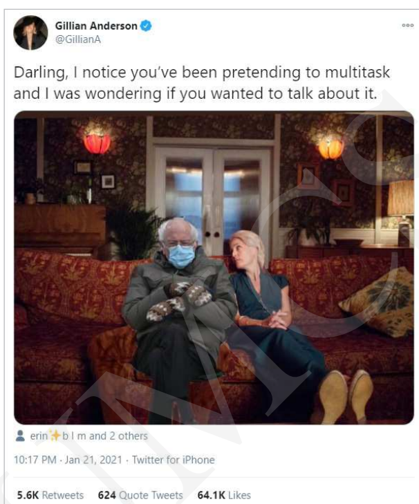
Fig. 6: Celebrities such as actress Gillian Anderson contributed to election memes spreading, sharing variations of “Bernie’s Mittens”

depicted as “‘cool’ and culturally informed both in memes and ... fan writings” (2020) which are widely created and shared. This relatable image soon lost all political significance, becoming seemingly a floating signifier without clear meaning or reference. The iconic photograph of Bernie in his mittens was inserted into anything – from pop cultural imagery such as the Totoro meme 6 to the NASA rover landing – and reproduced in many media, be it deep faked video clips or as a crocheted doll.