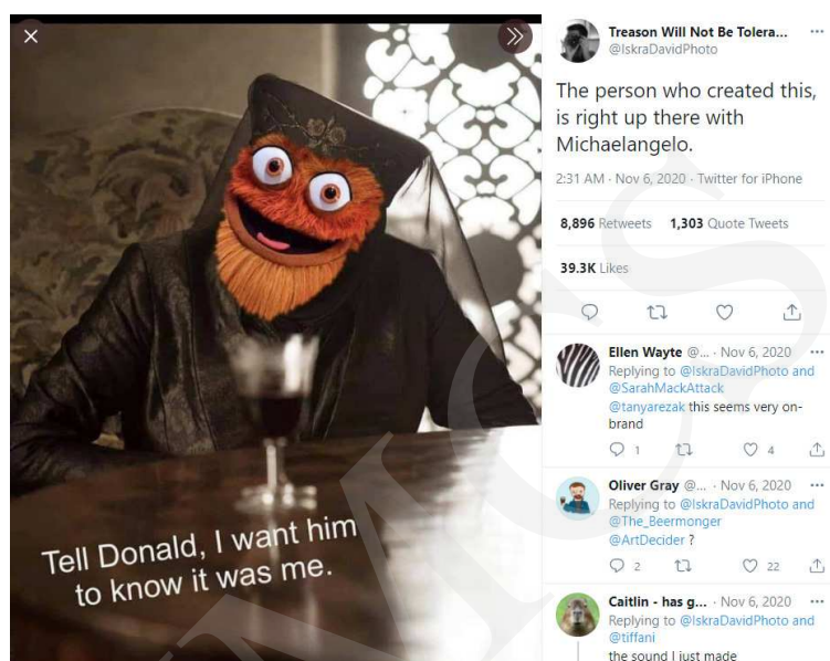
Fig. 3: Example of Gritty meme with high intertextuality by @IskraDavidPhoto (2020)

While the framing is similar to the previously discussed examples, in memes such as this 3 , several elements come together to create the multi-layered joke of the meme: Gritty's head is super-imposed on Olenna Tyrell, a character from HBO's Game of Thrones series. The show's quote is slightly altered to refer to Donald Trump, once again taking the place of a hated villain, this time Game of Thrones ' king Joffrey. Denisova (32) points out that "memes are coded messages and therefore can be confusing for various people: members of the audience may have varying abilities and skills to read the 'code'" in such cases. Here it is both necessary to know the context of the quotes – Olenna admitting to the murder of a tyrant king – and the event it references, with the implied metaphorical murder being Trump's loss of the election, which was attributed to the votes of leftist Philadelphians, as Pennsylvania flipping blue was seen as the key event cementing Biden's victory, metonymically referenced through Gritty.