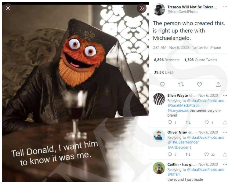
Fig. 3: Example of Gritty meme with high intertextuality by @IskraDavidPhoto (2020)

While the framing is similar to the previously discussed examples, in memes such as this 3 , several elements come together to create the multi-layered joke of the meme: Gritty's head is super-imposed on Olenna Tyrell, a character from HBO's Game of Thrones series. The show's quote is slightly altered to refer to Donald Trump, once again taking the place of a hated villain, this time Game of Thrones ' king Joffrey. Denisova (32) points out that "memes are coded messages and therefore can be confusing for various people: members of the audience may have varying abilities and skills to read the 'code'" in such cases. Here it is both necessary to know the context of the quotes – Olenna admitting to the murder of a tyrant king – and the event it references, with the implied metaphorical murder being Trump's loss of the election, which was attributed to the votes of leftist Philadelphians, as Pennsylvania flipping blue was seen as the key event cementing Biden's victory, metonymically referenced through Gritty.