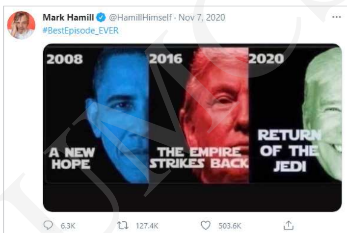
Fig. 2: The titles of the original Star Wars trilogy imposed on the American presidents from 2008 to 2020 (@HamillHimself, 2020).

Hence allusions to popular movies and TV shows form the base of many memes framing the weeks of the election week. Particularly references to such staples of geek fan culture as Star Wars , Marvel , and Game of Thrones were abundant, with even Mark Hamill, the actor playing Star Wars ' Luke Skywalker, sharing a highly popular meme after the election that was liked 500k times: