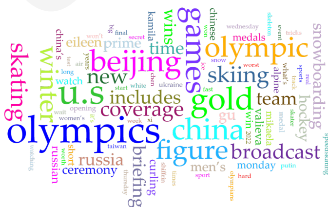
Figure 2. Words with frequency greater than 3 in the New York Times

As shown in the figure, the high-frequency words in the People's Daily are closely related to the research topic. The most frequently used term is literally “Beijing 2022 Winter Olympics” itself. Additionally, there are no negative terms observed in the figure.