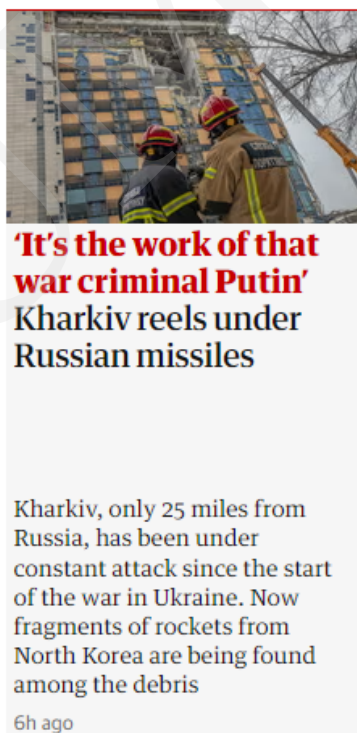
Figure 6. The Guardian, accessed on 19.01.2024

As for the parameters of newsworthiness, the parameters of reliability or evidentiality are the most prominent as the reporting verb says suggests that there is little to no evidence to back up what happened in Pakistan. Simply put, “Iran violated Pakistan’s airspace, killing two children” sounds more definite, as opposed to the original statement.