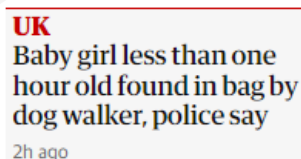
Figure 7. The Guardian, accessed on 19.01.2024

The parameters of newsworthiness present in this newsbite are enacted through emotivity as reels under carries a personalizing connotation. Moreover, the claim It's the work of... expresses certainty, which refers to the parameter of reliability that is connected to epistemic modality or modalization in systemic functional linguistics.