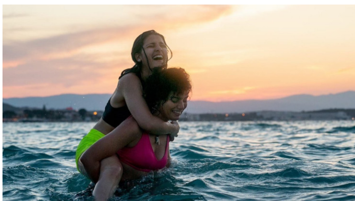
The Swimmers (2022), promotional picture for the movie

The movie The Swimmers (USA & UK, 2022) tells the real story of the teenage sisters Yusra and Sarah Mardini who fled their home in Syria due to the war. Dive into their inspiring story with our in-depth look at the movie and our survey on it. Discover how this powerful film is changing perspectives on the refugee crisis and resonating with audiences worldwide.