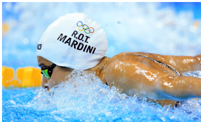
Picture: Yusra Mardini swimming for the Refugee Olympic Team (R.O.T.) at the Olympics in Rio de Janeiro, 2016 (source: The Guardian)

https://www.theguardian.com/world/2017/mar/17/yusra-mardini-syrian-refugee-and-olympic-swimmer-inspires-film#img-1