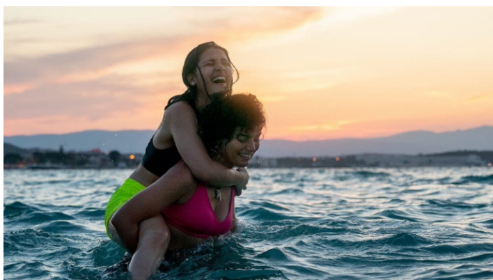
The Swimmers (2022), promotional picture for the movie

The movie The Swimmers (USA & UK, 2022) tells the real story of the teenage sisters Yusra and Sarah Mardini who fled their home in Syria due to the war. Dive into their inspiring story with our in-depth look at the movie and our survey on it. Discover how this powerful film is changing perspectives on the refugee crisis and resonating with audiences worldwide.