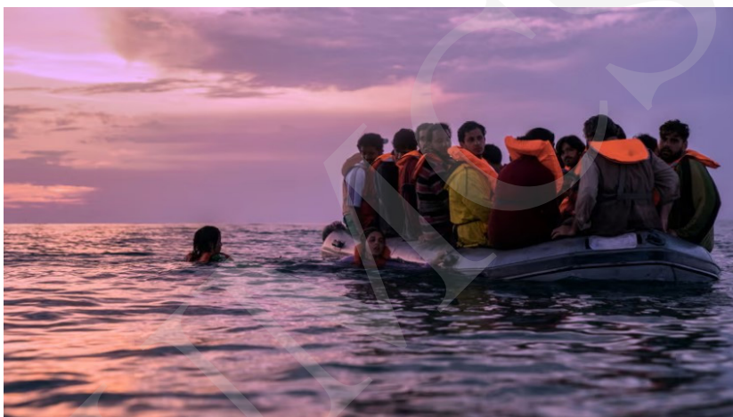
Picture: Yusra and Sarah swimming next to the sinking rubber dinghy, “The Swimmers”, 2022 https://readthespirit.com/visual-parables/wp-content/uploads/sites/21/2023/09/Dinghy.jpg

It’s not a big surprise that all of our respondents mentioned the ‘boat scene’; the moment when the big group of “desperate and scared” refugees sits together in a small dinghy and the situation gets more and more dangerous from one moment to another. Many respondents were particularly scared by the huge level of uncertainty that the flight over the sea brings. The worries don’t end with the uncertainty though; the difficulties and unexpected, fatal happenings, such as “when the engine went out” caused many of the passengers to lose hope in the movie as well.