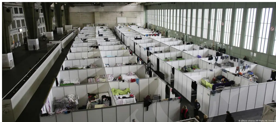
Picture: the refugee accommodation in the hangar of the airport Berlin Tempelhof, 2016

https://www.dw.com/en/berlin-to-stop-housing-refugees-in-tempelhof-hangars-in-theory/a-19415068