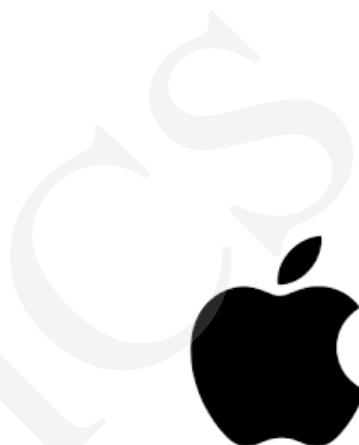
Figure 1b. Apple Inc. logo (© Apple Inc.)

It is clear that this piece of promotional material is formed upon the popular proverb An apple a day keeps a doctor away . Crucially, the key word apple has a double meaning. It obviously alludes to the proverb, while on the second look one may uncover the hidden, intended meaning, namely a reference to Apple Inc. multinational technology company which specialises in iPhones, iPads and other electronic devices (cf. its logo in Figure 1b). Lambton Mall tries to encourage prospective buyers to come and do their shopping in its centre because every customer has a chance to win one of many Apple themed accessories. Through this ingenious marketing trick, copywriters strengthen the advertisement's potential. Besides, allusions to tradition and heritage from former generations augments the trust in the company's potential customers, which in turn encourages them to do the shopping.