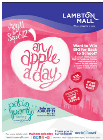
Figure 1a. Advertisement of the Lambton Mall ( http://click-sarnia.com/apple-day-lambton-mall-contest/ , retrieved 20 February 2016)

Moreover, modern advertising business relies heavily on the persuasive power of proverbs, frequently building its eye-catching slogans upon their structure. As an illustration, consider the advertisement by the Lambton Shopping Mall (Figure 1a).