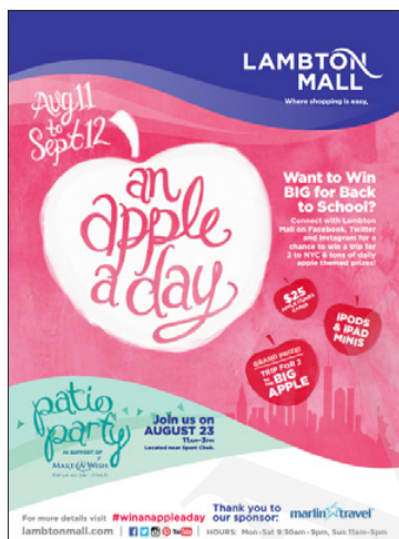
Figure 1a. Advertisement of the Lambton Mall ( http://click-sarnia.com/apple-day-lambton-mall-contest/ , retrieved 20 February 2016)

Moreover, modern advertising business relies heavily on the persuasive power of proverbs, frequently building its eye-catching slogans upon their structure. As an illustration, consider the advertisement by the Lambton Shopping Mall (Figure 1a).