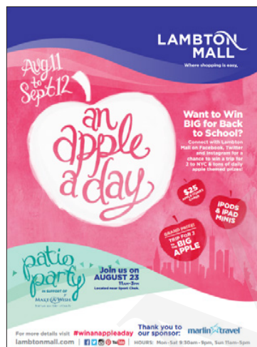
Figure 1a. Advertisement of the Lambton Mall ( http://click-sarnia.com/apple-day-lambton-mall-contest/ , retrieved 20 February 2016)

Moreover, modern advertising business relies heavily on the persuasive power of proverbs, frequently building its eye-catching slogans upon their structure. As an illustration, consider the advertisement by the Lambton Shopping Mall (Figure 1a).