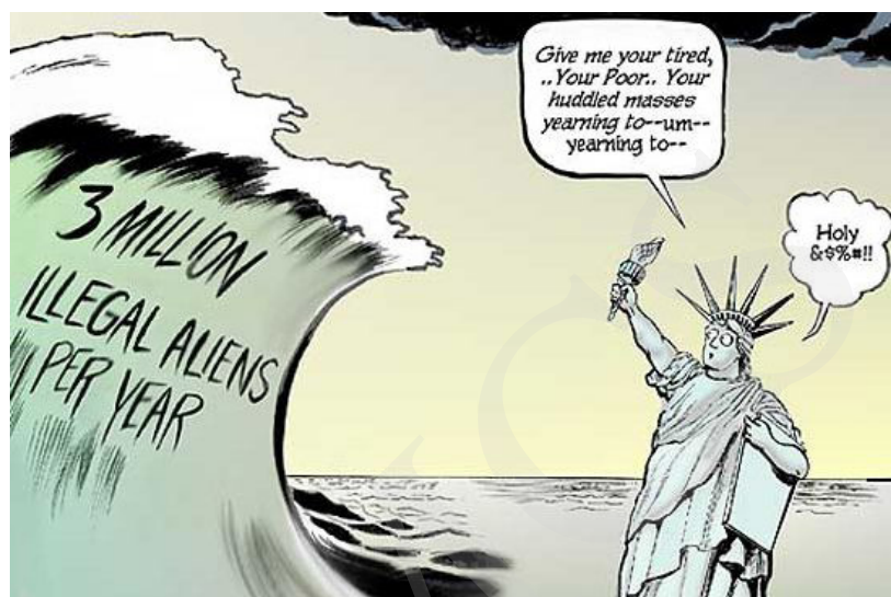
Figure 1. The alien tsunami that scares even the Lady Liberty (CNS News.com, 2010)

Source: E. Pluribus Unum. “Cartoons.” 2017. Accessed June 10. https://epluribusunumjcom2010.wordpress.com/cartoons/ .