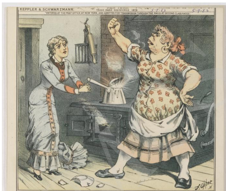
Figure 7. An overbearing Irish maid ( Puck , 1883)