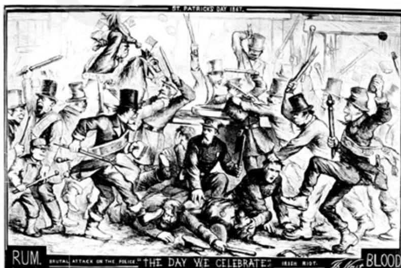
Figure 6. St. Patrick's celebration that turned into riot ( Harpers Weekly , 1867)