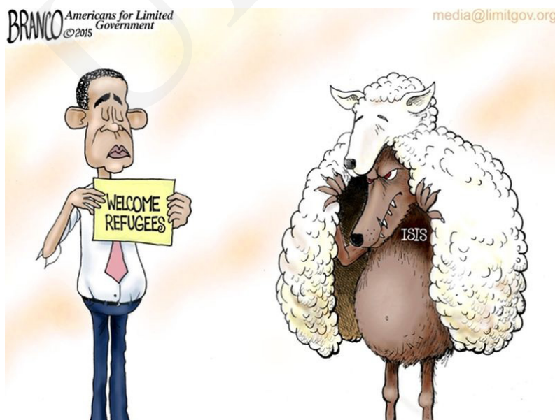
Figure 2. Representation of refugees as a lurking danger (ALG, 2015)