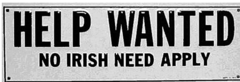
Figure 4. The so-called NINA sign