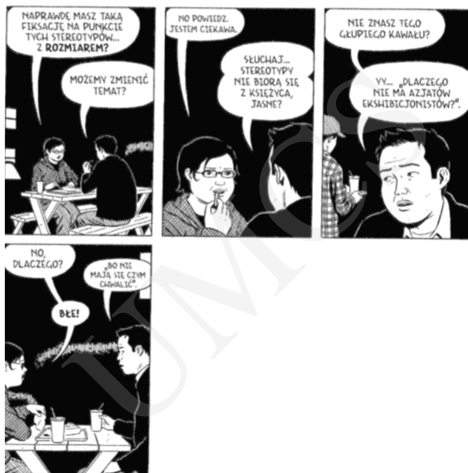
Fig 27. Tomine, A. (2010). Niedoskonałości . Trans: Murawska, A. Warszawa: Kultura Gniewu, p. 57.

The joke in the English version is based on the difference between the words ‘Caucasian’ and ‘Asian,’ which, apart from the meaning, is the syllable ‘cauc’ at the beginning of the former. The pun bases on the alleged correspondence between the length of these words and the size of Caucasians’ and Asians’ penises as well as the homophonic resemblance between ‘cauc’ and ‘cock.’ It is impossible to convey it literally into Polish, as ‘Caucasian’ translates into ‘biały’ ( white ) and ‘Asians’ into ‘Azjaci.’ There is no similarity between the two. Murawska’s solution is well-conceived, as it conveys the same preconceptions and also regards the size of phalluses in a racist, though humorous, way, even though it is realized in a completely different way. The reaction of the Polish readers is likely to be the same as that of the readers of the original.