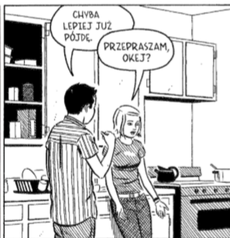
Fig 15. Tomine, A. (2010). Niedoskonałości . Trans: Murawska, A. Warszawa: Kultura Gniewu, p. 50.