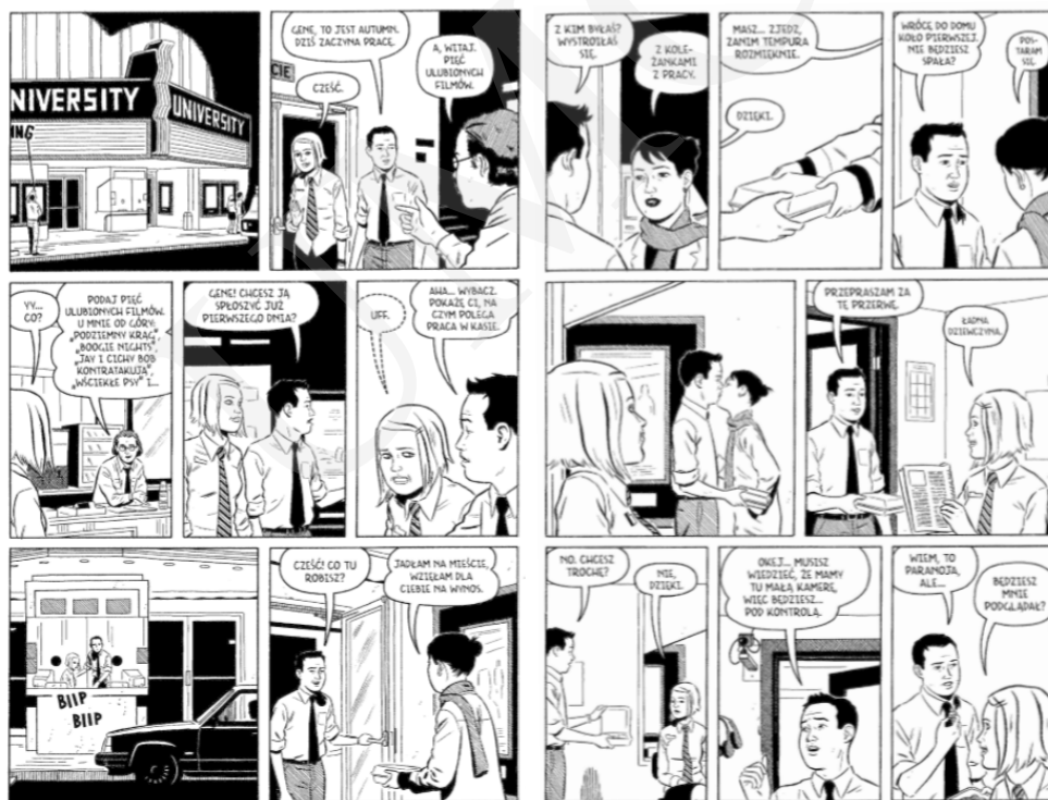
Fig 1. An example of a page composition in Tomine's Shortcomings .

Indeed, Tomine uses the comic book conventions in Shortcomings advisedly. The novel is characterized by formal minimalism and realistic depiction of diegetic space. Panels are of similar size and shape: always square or rectangular. There are six to nine of them on every page. Panel frames are regular, quite thin, unobtrusive. Breaches and bleeding out of panels never occur.