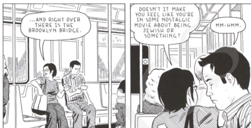
Fig 20. Tomine A. (2012). Shortcomings . London: Faber and Faber, p. 79.

A similar reference is also made by Kim, when she reflects on living in New York: