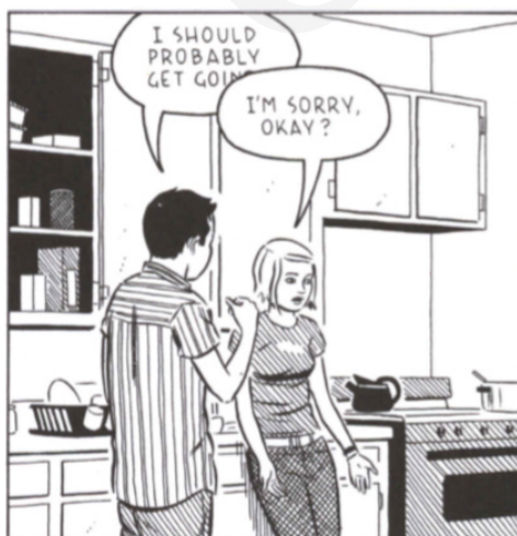
Fig 14. Tomine, A. (2012). Shortcomings . London: Faber and Faber, p. 50.

This convention was maintained in all cases but one: