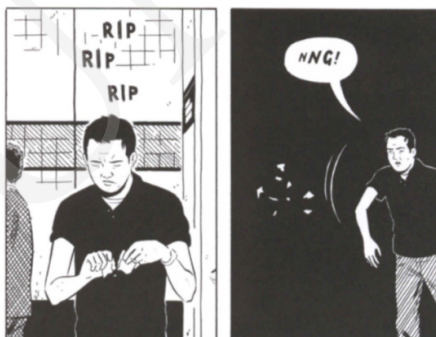
Fig 4. Tomine, A. (2012) Shortcomings . London: Faber and Faber, p. 104.

Motion lines are scarce and subtle and appear usually when Ben slams the phone or throws something on the ground: