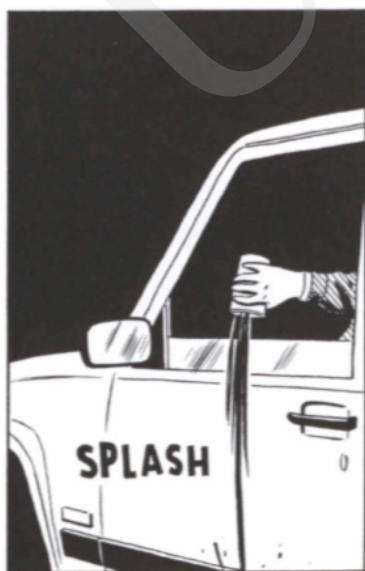
Fig 10. Tomine, A. (2012). Shortcomings . London: Faber and Faber, p. 37.