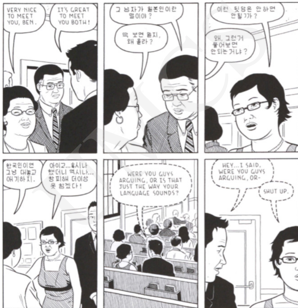
Fig 28. Tomine A. (2012). Shortcomings . London: Faber and Faber, p. 27.

The appearance of passages in Asian languages with no translation in the original is also important in terms of creating tension and depicting characters' emotions, as seen in the following excerpt: