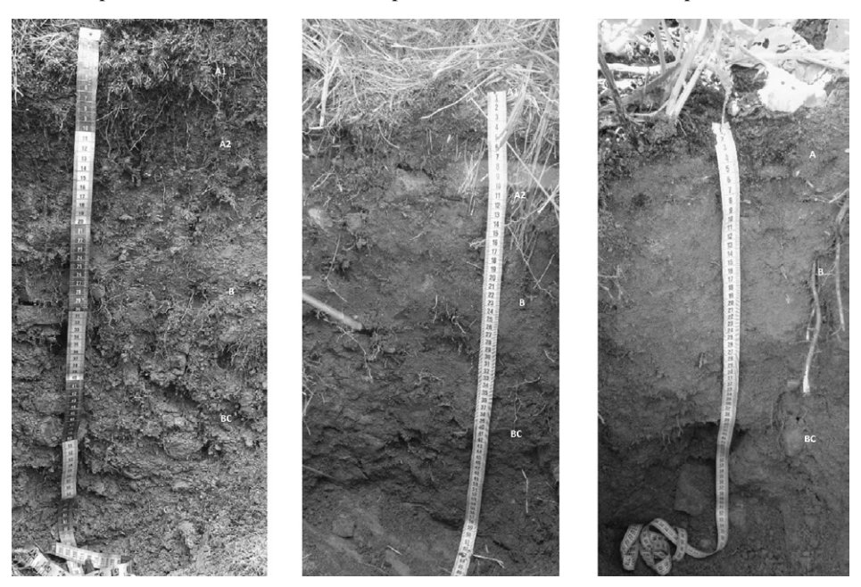
Fig. 3. Morphological structure of alpine (SV–1), subalpine (SV–4) and anthropogenically altered (SV–5) profile of the mountain-meadow brown soil

Since the formation conditions of mountain-meadow soils are very wet climate and the washing type of water regime, this promotes bases leaching out of the soil profile. Due to the lack of neutralizing cations, plant residues decompose to form corrosive organic acids. Therefore, most indicators are confined to acidity and humus horizon A, the bottom layer of turf and soil acidity naturally decreases down the profile. Alpine zone soils are more acidic due to the large concentration of aluminum-hydrogen exchange (Table 2). It should be noted that the strong acidity of soil solution does not result in podzol formation. Mountain-meadow brown soils of the Svydovets array are leached, base unsaturated (degree of saturation is less than 10%), with soil solution acidic reaction ( pH_{KCI} less than 4.5) (Table 2).