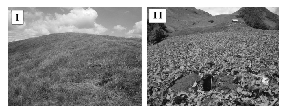
Fig. 2. Meadows with integral (I) and anthropogenically altered (II) phytocoenoses

Haphazard, inefficient use of mountain pastures leads to their degradation. With increase in the anthropogenic pressure, following stages change: destruction of vegetation; destruction of soil; destruction of lithosphere. Ecologically unlimited meadows development leads to the intensification of degradation processes and the formation of specific anthropogenically altered mountain-meadow brown soils that differ in their properties and qualities from the virgin ones (Fig. 2).