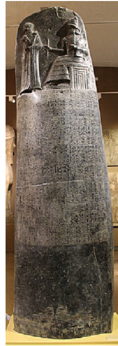
Fig. 3. The column with laws of the king of Babylon, Hammurabi