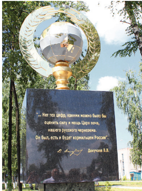
Fig. 6. The monument to chernozem in the Panins'kiy district (Russia)

The monument to chernozem was opened on June 27, 2013 in the Panins'kiy district of the Voronezh region, at the 130 th anniversary of the publication of the book by Dokuchaev, Russian Chernozem (Fig. 6). It is made of marble and metal, it consists of two elements: a black marble cube with a side of 1.1 m, which symbolizes a "black diamond", and the planet above it, framed with golden ears. On the front side of the cube, the most famous statement of Dokuchaev is written: "There are no such figures that could be used to estimate the strength and power of the King of Soils, our Russian chernozem. It has been and will remain the breadwinner of Russia". The cost of the monument was about 1 million rubles.