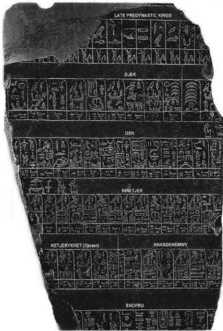
Fig. 1. The Palermo Stone (reconstruction)