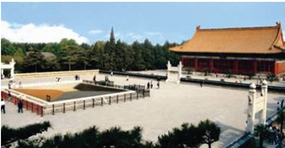
Fig. 5. The first soil monument in the world (the Imperial Garden of Beijing, China)

Bearing in mind the importance of nature protection, in particular the soil, people build monuments dedicated to various natural objects. The first famous soil monument was built in China, in the center of Beijing, in 1421 in the Imperial Garden (Fig. 5). It has the form of a raised square 6 \times 6 m covered with a soil of different color and origin. In the center there is a circle filled with loess – typical for China soil-forming rocks. The rest of the square is divided into 4 sectors, directed at the main sides of the horizon. The northern sector is filled with chernozem, distributed in north-eastern China; the southern sector is filled with red soil of the southern part of the country; the western sector is filled with a light soil of desert origin; the eastern sector is filled with gley muddy soil, typical for rice fields which are found in the center of the country. One can find the following phrase: “This place was built in 1421 in the era of the Ming Dynasty. Inside there is a yellow soil, on the eastern side – blue, on the south – red, on the west – white and on the north – black soil. All these colors of soils belong to the emperor”.