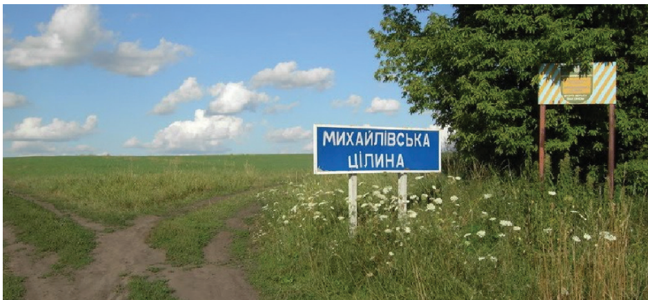
Fig. 4. The Nature Reserve “Mikhailivska Cilyna” (Sumy oblast)

In Ukraine, chernozems in the virgin state have been preserved only in the nature reserves of Mikhailivska in the Sumy region (Fig. 4), the Khomut steppe in Donetsk, the Stril'tsivs'kyi steppe in the Luhansk and Kamyani graves in the