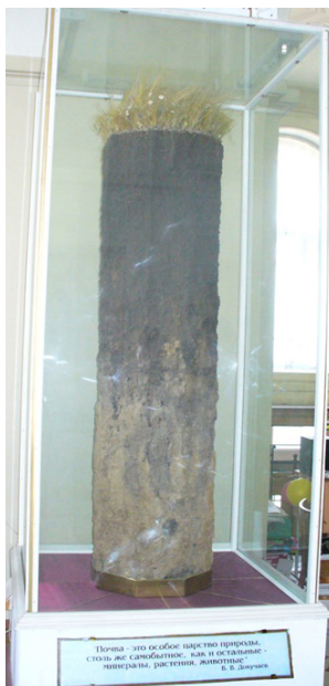
Fig. 8. The monolith of chernozem in St. Petersburg (Russia)

People's anxiety over the state of soils, and in particular of chernozems, appeared in the proclamation of 2015 as the United Nations International Year of Soils.