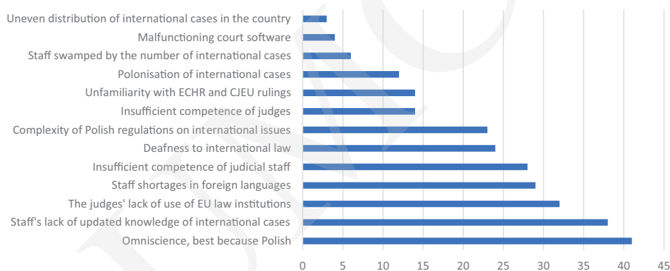
Figure 3. Main problems of Polish courts in international elements by lawyers surveyed (aggregated number of indications in interviews)

The lawyers who participated in the survey, drawing on their extensive experience within the judicial system, compiled a comprehensive catalogue identifying a range of issues perceived in Polish courts, particularly among court staff and judges, regarding the application of international and European Union law in routine judicial proceedings. The insights provided by these legal practitioners uncover a pervasive array of problems and deficiencies within the framework of the Polish judiciary.