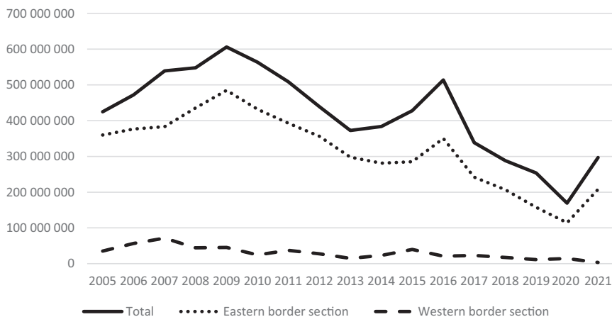
Figure 2. Disclosed illegal tobacco products in Poland in the years 2005–2021 according to the section of the national border (pcs of cigarettes)