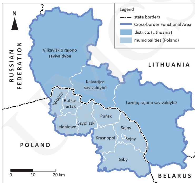
Figure 3. Delimitation of the Lithuanian-Polish Cross-Border Functional Area

region on the basis of existing functional links (see Figure 3) and the identification of priorities and directions for the development of CBC. Based on the solutions developed as part of the project, the Polish and Lithuanian local governments signed a document in 2021 “Agreement on the Creation of a Touristic Cross-Border Functional Area ‘Jatvingia – the land of the Yotvingians’ in the Polish-Lithuanian border region” and, thus, formalised the creation of the CFA.